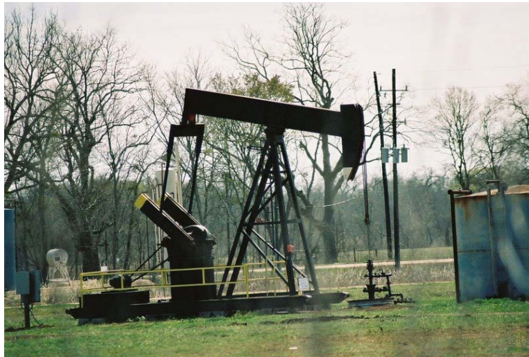
Flow Research photo of oil field pumpjack near Houston, TX